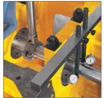
Fig. 9 Complete boring equipment.