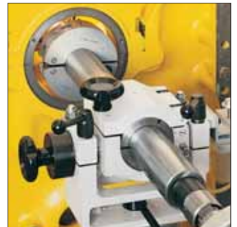
Fig. 1 Final centering fine, with dial indicator attachment.