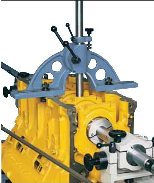
Fig. 7 Setting up a V-block; one can see the central support for the boring bar. The special lock clamps are available on request, at extra cost.